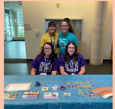
Guelph-Humber's Clubs Fair.