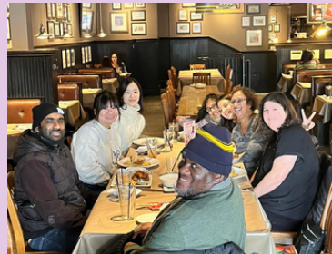
University of Toronto-Scarborough Best Buddies at their chapter's dine-in event!

Corpus Christi Best Buddies participated in their school's Valentine's Day door decorating contest!