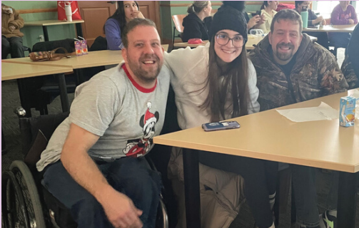
St. Francis Xavier University Best Buddies enjoying their "Movie Afternoon."

News & updates for our Best Buddies Canada Chapters